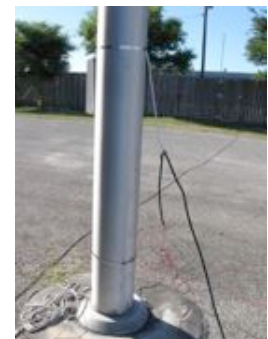
Radials spread at the base of the flagpole

We had several other antennas up. But the flagpole was the treat of the day. Everyone had to try working a contact using the flagpole. The CW committee was totally pleased to be passing Field Day traffic on OTN later in the afternoon. Just remember, when your rope has broken, just load up the flagpole.