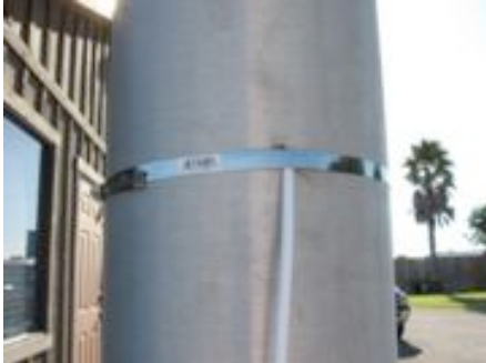
Coax pressed to the flagpole with hose clamps

As the antenna committee stood at the base of the flag pole in mourning for their great antenna plan the CW committee made the bold suggestion that we load up the flag pole itself to see if it would work on one of the bands. The idea was met with skepticism at first. However, the technical gurus were deep in thought, pondering the possibilities.